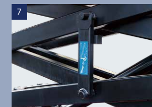
Supporting arms: To protect the operator when he is doing repair or maintenance job