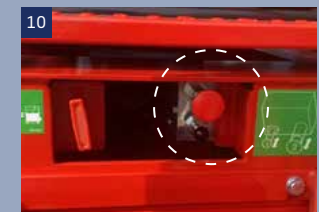
Manual release valve: When the machine can not move, you can push the machine after pressing this valve