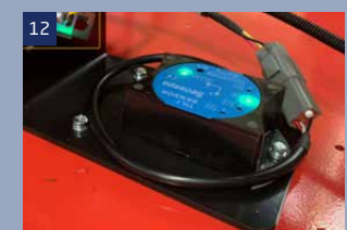
Angle sensor: when it is lifting and walking on the slope, the sensor will automatically judge the status of the machine, if the angle is larger than the rated angle, it will alarm to remind the operator.