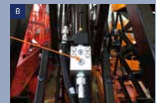
Explosion proof valve: To prevent the machine falling when the oil pipe is leaking