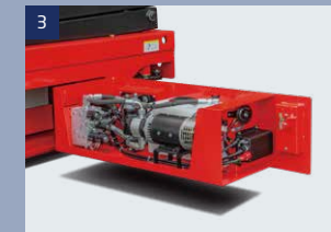
Hydraulic and electric system